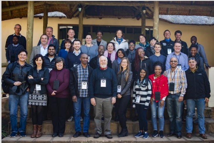
Delegates at the 31 st PSSA congress

What I find interesting is the fact that over recent years the industry and other areas of applied phycology have become more widely represented at our PSSA meetings. The core of our Society has always been academic phycologists, but clearly there are more phycologists amongst us, particularly outside of academia. Perhaps these 'cryptophycologists' do not self-identify as phycologists, even though the work they do is clearly inherently phycological. Or perhaps our campaigns to attract new members into our society need to be widened and we need to be more active in seeking out practicing phycologists in all the sectors where they might be employed. This means that as a Society we need to locate—either by word of mouth or through active research—all these 'microniches' that offer fertile ground for phycological endeavors in South Africa. I would also like to call that we once again extend our reach to elsewhere in southern Africa, as we have done in previous years. We are called the Phycological Society of Southern Africa for a reason. Let us live up to that name.